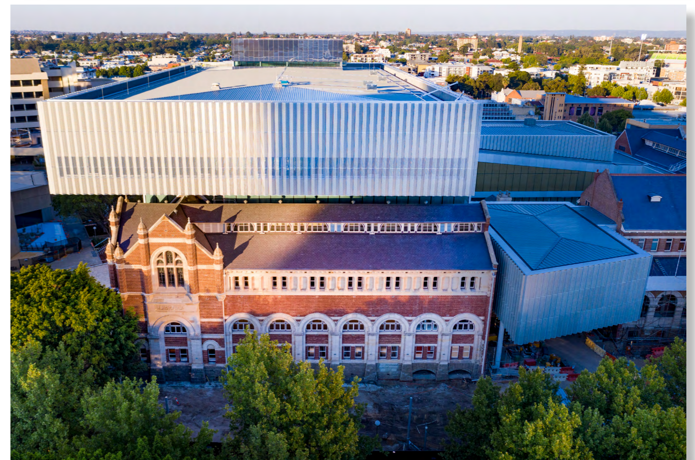
WA Museum Boola Bardip Hackett Hall and cantilever (top image) and James Street view (bottom image).