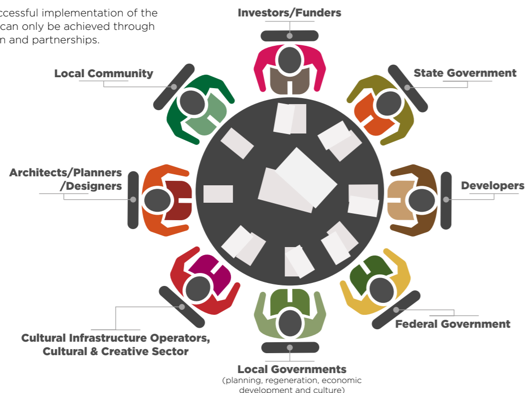
Figure 1: Successful implementation of the Framework can only be achieved through collaboration and partnerships.

It is critical to the sustainability of the cultural and creative ecosystem in WA to acknowledge that not only are cultural buildings and spaces required, but staff to operate and maintain this infrastructure are vital. Cultural infrastructure, particularly in outer-metropolitan areas and regional WA where many cultural spaces are run by volunteers, requires investment in ensuring staff have the capacity and resources to deliver professional services and local experiences.