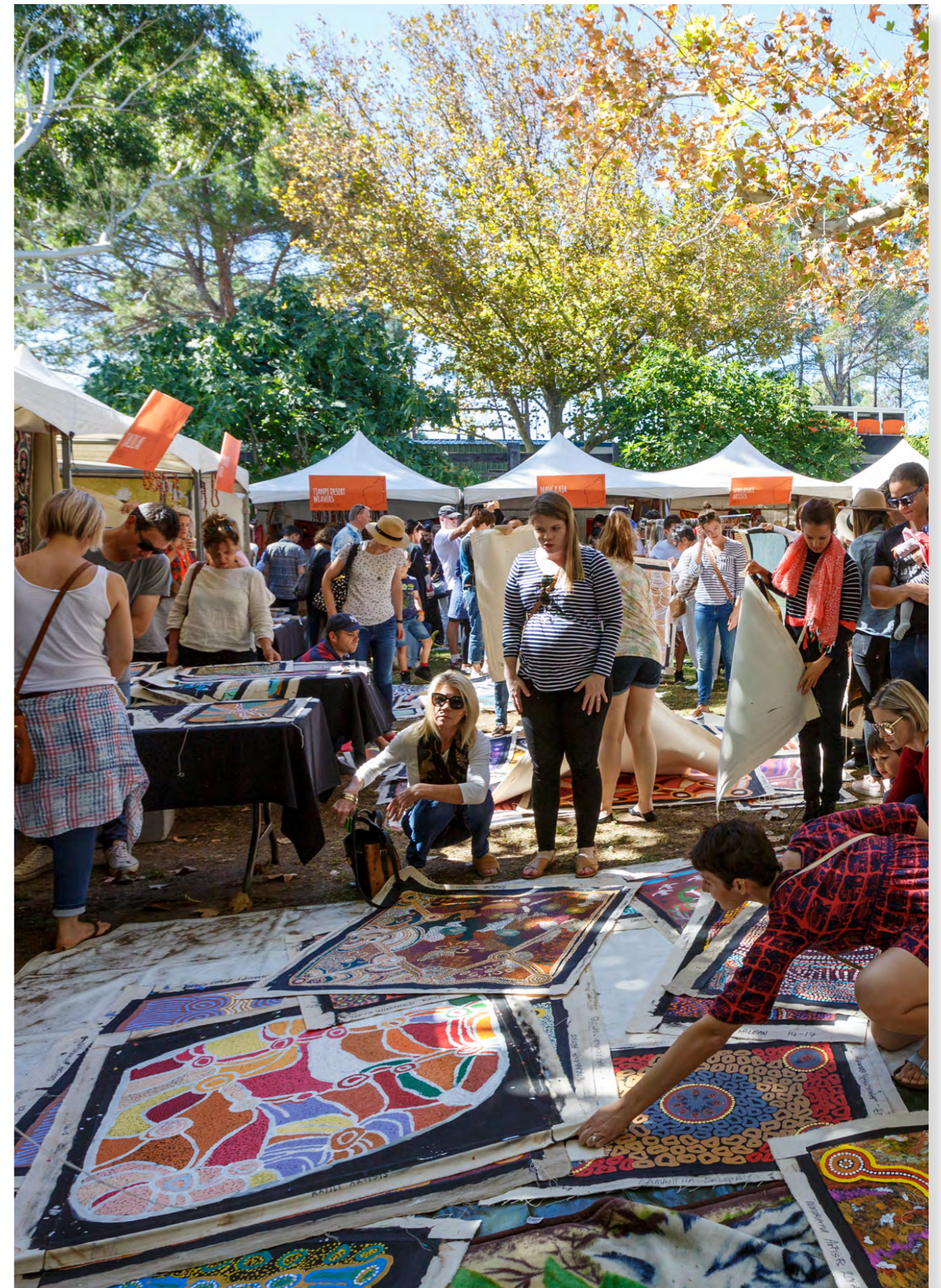
Revealed: WA Aboriginal Art Market, Fremantle Arts Centre, 2017.