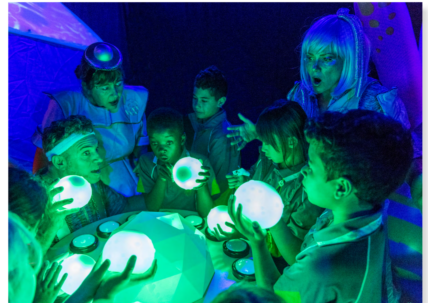
Whoosh! by Sensorium Theatre, picture shows Sensorium artists/crew co-piloting the Whoosh! spaceship with young cadets with a disability. Whoosh! is a sensory theatre production created by Sensorium Theatre, produced by Performing Lines WA and presented here in an education support school; March 2018.