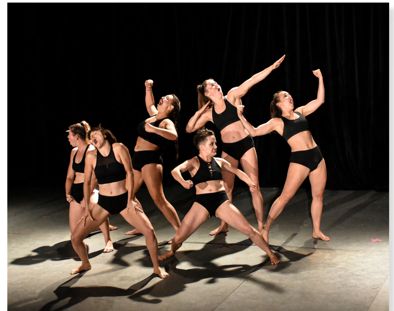
Yuck Circus at FRINGE WORLD.

The following sections outline each of these focus areas in detail, summarise the current situation for WA, identify existing challenges, specify opportunities to move forward, and highlight key benefits.