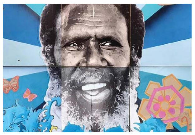
Mater Dei College, 2017

The school designed and painted a mural of Eddie Mabo which was installed in the central courtyard at the College. The mural involved forty students over Term 2 and 3. Students contributed their time to construct and paint the powerful image which is now used as a teaching tool. In addition to the Eddie Mabo mural, students created a short animation of Eddie Mabo's many achievements. All future Year 7 and 8 students will learn about Eddie Mabo by viewing this video.