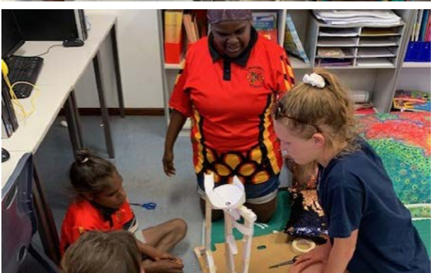
Kennedy Baptist College, 2019