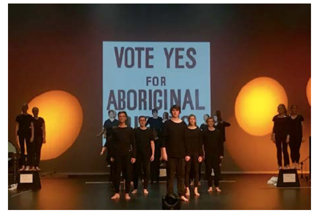
Newman College, 2018

Year 11 drama students collaborated with Aboriginal artists to create and perform an original piece of epic theatre titled 'Heart Learning (Koort Kadadjiny Kadadjiny)'. The theatre piece is a celebration of diversity, survival, transformation and growth in the hope for reconciliation. The performance used Noongar language, original music, song, body percussion and movement, and digital projection of visual art to share a true cultural representation of Australia's history from 1788 to present.