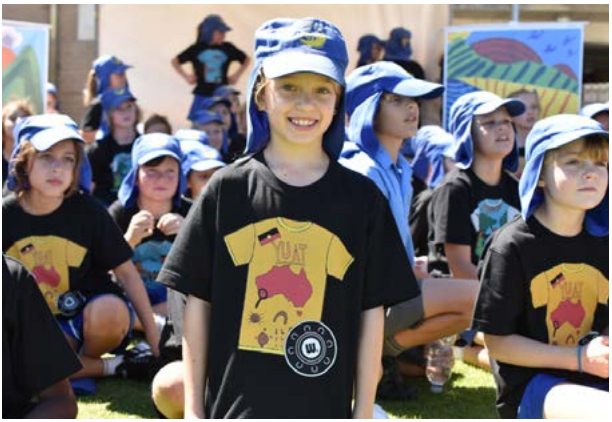
Mater Dei College, 2018