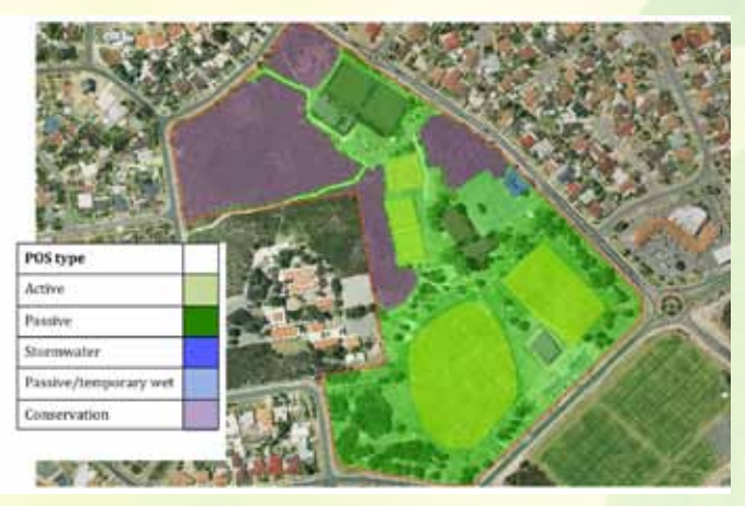
Figure 1: Example of POS area map showing zones (Quinns Rock).

In Stage Two, the ground useage patterns for two sports (cricket and soccer) in the south west corridor were studied in detail.